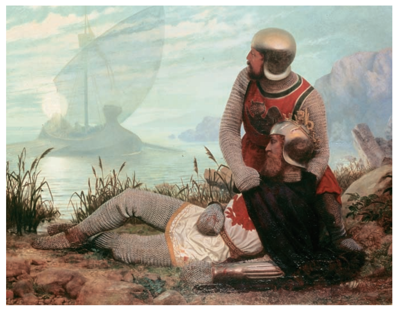
Morte d'Arthur (1862), John Mulcaster Carrick. Private collection.

TWO FAVORITES About 1375, an anonymous English poet wrote Sir Gawain and the Green Knight , recounting the marvelous adventures of a knight of Arthur's court who faces a series of extraordinary challenges. Exciting, suspenseful, and peopled by an array of memorable characters, from the mysterious green giant who survives beheading to the all-too-human Sir Gawain, the 2,500-line poem is easy to imagine as a favorite of troubadors and their audiences.